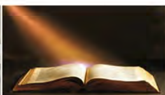
NOURISHED BY THE WORD OF GOD