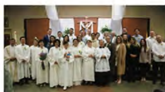
UNITED AS THE BODY OF CHRIST AND THE COMMUNION OF SAINTS

CHANGE A LIFE FOREVER INVITE SOMEONE TO BECOME CATHOLIC