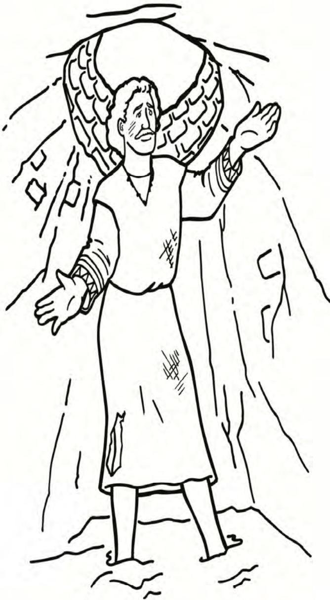
And so they took Jeremiah and threw him into the cistern... Jeremiah 38 : 6