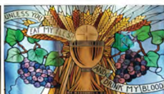
CENTERED IN THE EUCHARIST