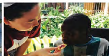
SERVING IN THE MISSION OF SALVATION