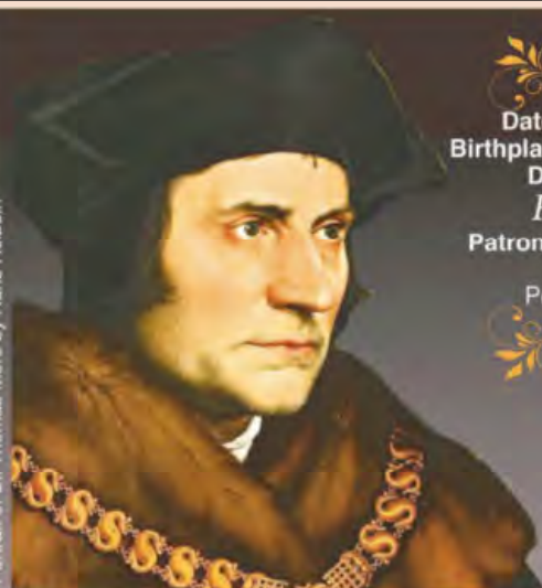
Portrait of St. Thomas More by Hans Holbein

He enters the service of King Henry VIII, taking a job as Master of Requests in 1518, was knighted and becomes ambassador in 1521.