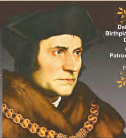
Portrait of St. Thomas More by Hans Holbein

He enters the service of King Henry VIII, taking a job as Master of Requests in 1518, was knighted and becomes ambassador in 1521.