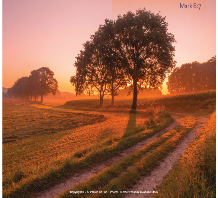
Copyright © J.S. Paluch Co. Inc. - Photos: © creativenature.nl/Adobe Stock